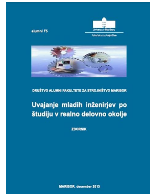
Proceedings of the “round table” Introduction of young engineers into the real economy